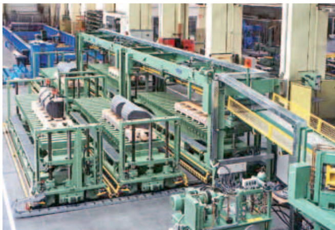
STA (2) stacker for logs