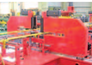
2 hole punching units