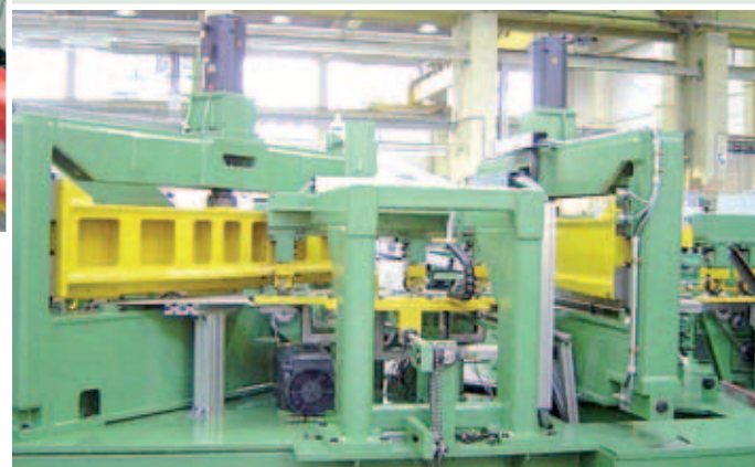
2 fixed shears