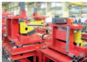
2 V notches