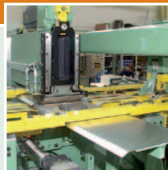
Slot punching unit