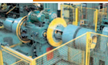
Long arm decoiler