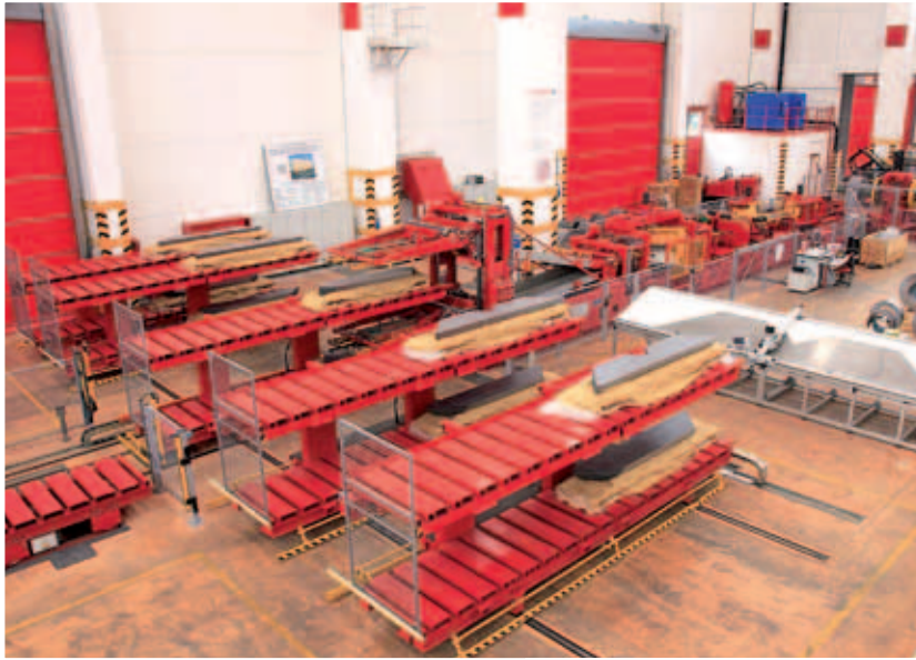
DW/T stacker with 5 stacking cars