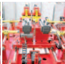
4 tip cutting shears