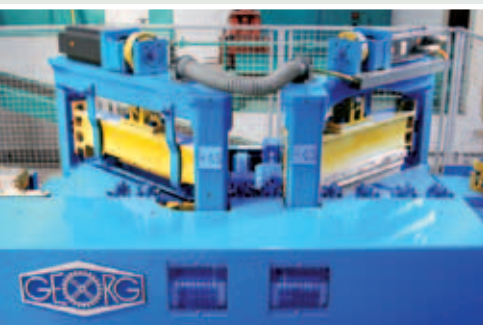
Fixed shears, electric