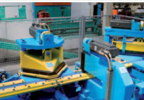
V notch & Hole punch, electric