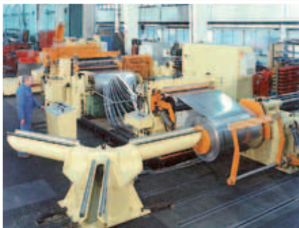
3 arm capstan