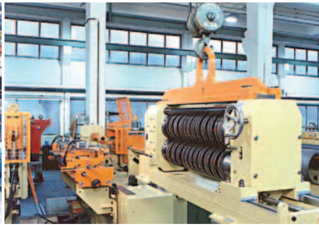
Slitting head change by crane