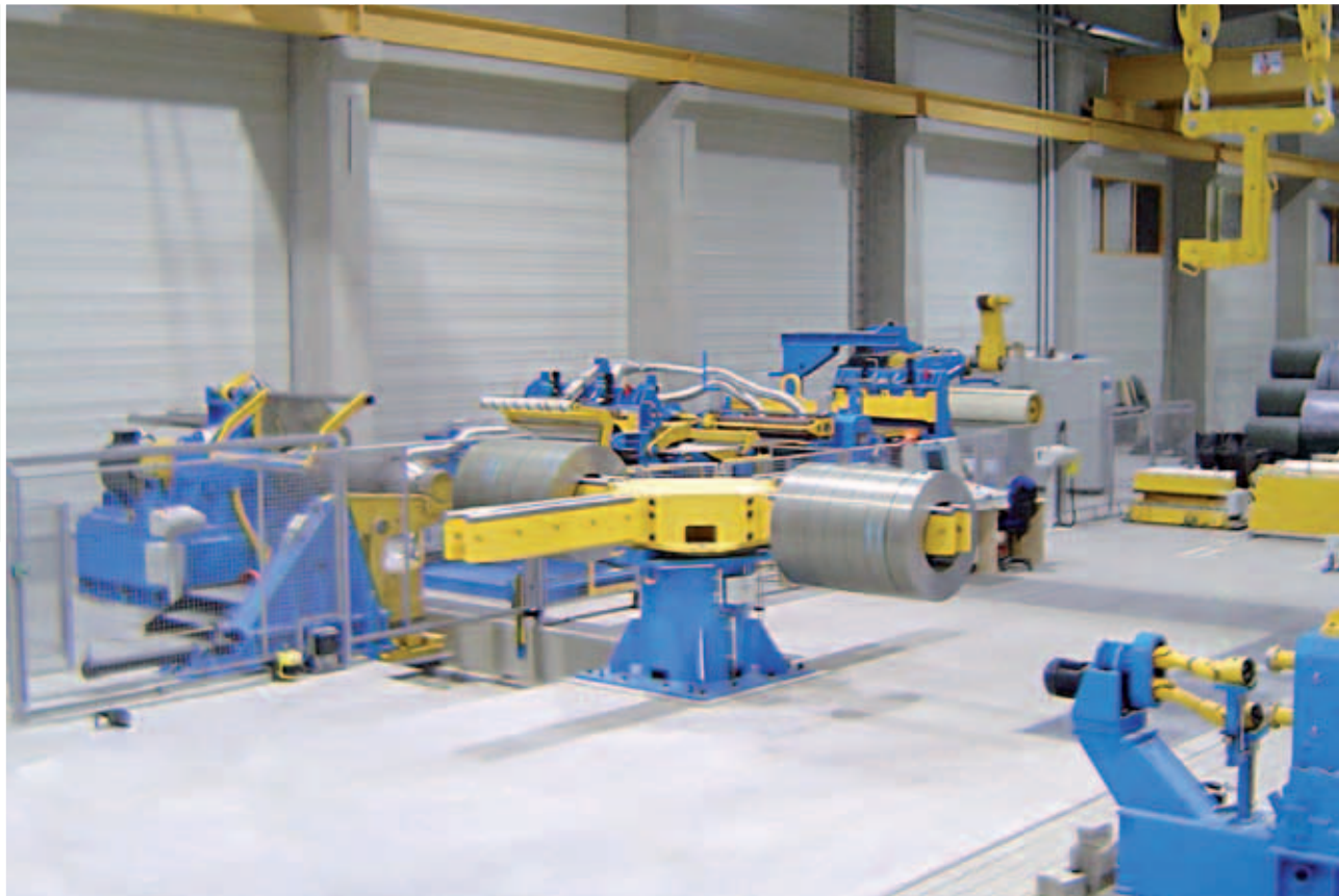
200 m/min slitting line 12 tonne coil capacity