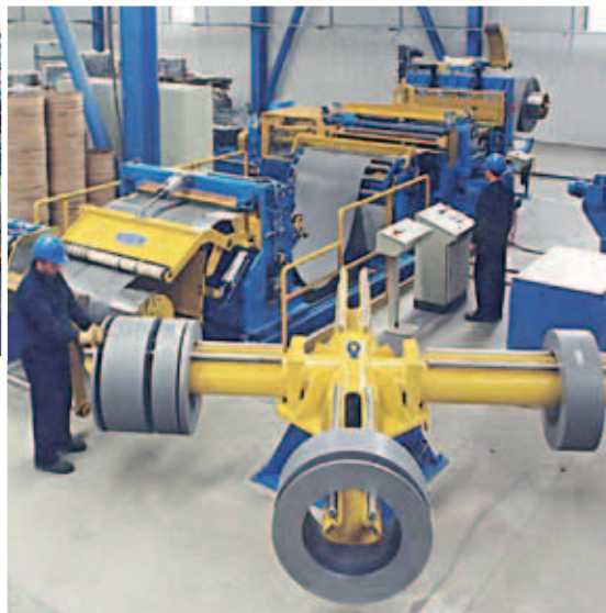
4 arm capstan